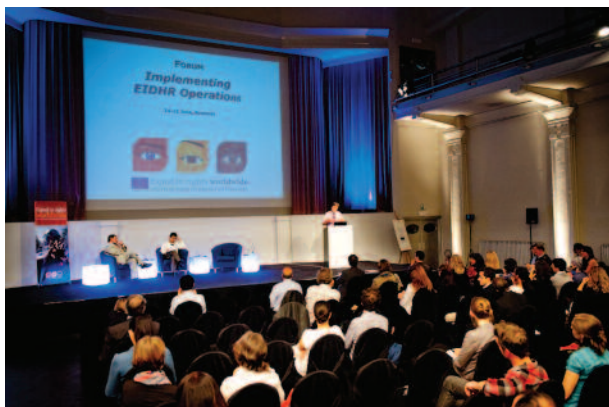
European Instrument for Democracy and Human Rights (EIDHR) forum, Brussels, 2011