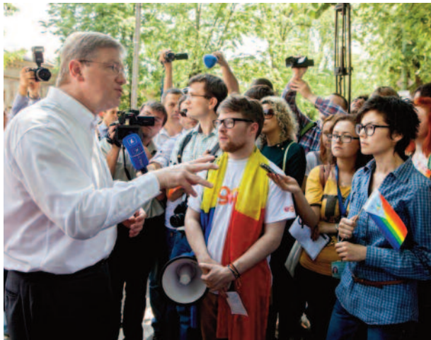
European Commissioner Štefan Füle attends LGBT rally in Moldova.

As a consequence of HRDs’ work, family members of HRDs may be threatened or attacked. While the EU does not explicitly mention family members of HRDs in its commitments, HRDs should nevertheless include family members at risk when requesting EU protective action. EU commitments relate to HRDs working at both registered and non-registered organisations.