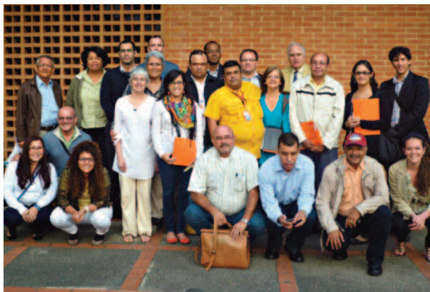
Venezuelan human rights defenders at a Front Line Defenders workshop on the EU Guidelines in 2013