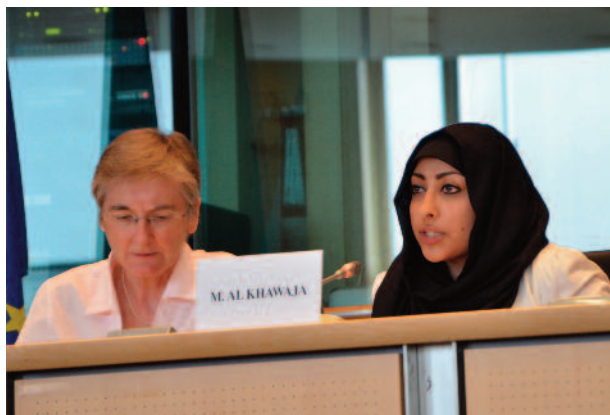
Maryam Al-Khawaja from Bahrain addresses an event at the European Parliament to celebrate the first anniversary of the EU Strategic Framework on Human Rights, 2013

EU local statements can express concern about problems like the arbitrary detention of HRDs, conditions of detention of HRDs, the harassment of HRDs, killing of HRDs, the raiding of the offices of human rights organisations, and call on the government to take appropriate measures, like releasing detained HRDs, protecting HRDs, investigating attacks on HRDs and bringing those responsible to justice,